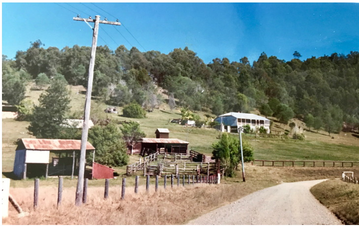
The dairy, farm buildings, and farm house This photo was taken 30 years ago, but looks essentially as it did in the 50s.