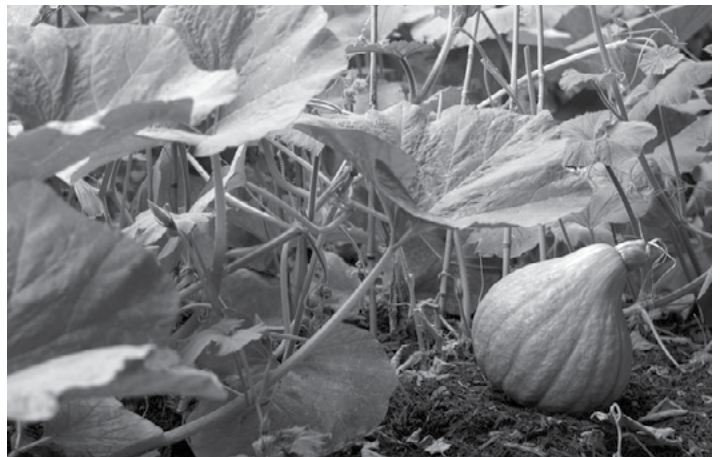
A lone winter garden squash

1 Tuesday Nov. 2 10 a.m.-noon 212SNR401 $25 Zoom