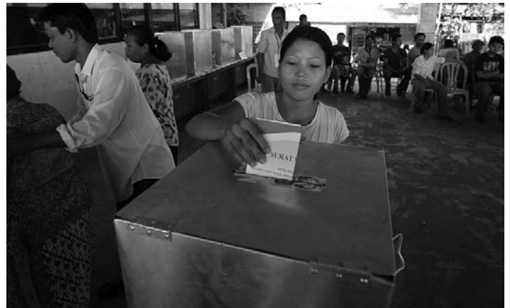
A vote is cast in Indonesia's 2009 presidential election

1 Wednesday Nov. 10 2-4 p.m. 212SNR363 $25 Zoom