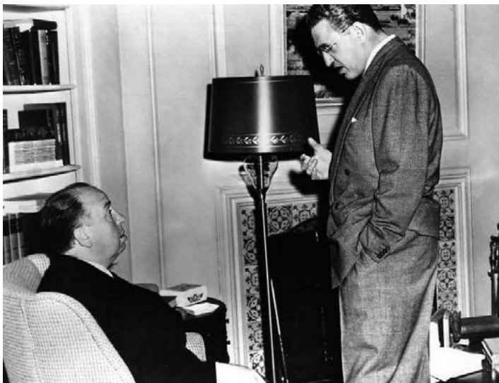
Alfred Hitchcock discusses Spellbound with Selznick in 1945

1 Monday Nov. 29 2-4 p.m. 212SNR315 $25 Zoom