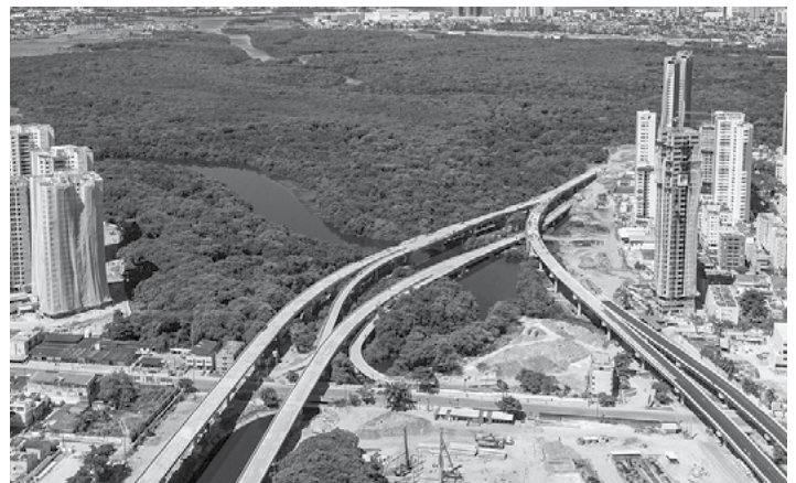
Urban mangrove forests exemplify the fiscal benefits (erosion control) achieved by conserving natural environments – courtesy of Portal da Copa/ME

1 Friday Oct. 8 2-4 p.m. 212SNR203 $25 Zoom