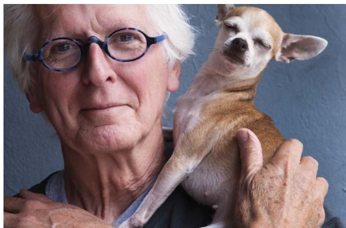
Age doesn't change the love we feel for our pets! See page 3

Need help enrolling? Our Student Services team is available by phone to help! Call the number above and leave a message asking for a call back. Include your phone number and an email where you can be reached. Student Services office hours are: Monday-Friday, 8:30 a.m. to 4:30 p.m.